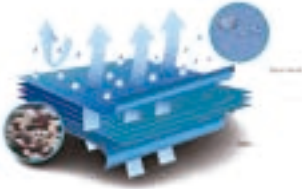
5 LAYER SPUNBOND

Our Disposable Surgical Gowns are made using 5 layers of spunbond (SMMMS) which are anti-static, anti-blood, anti-water and wrapped in plastic so they are kept clean. This product will support the performance of every medical officer. This product is disposable, so it is very practical and hygienic.